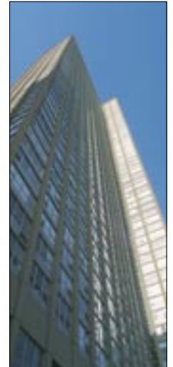
Park Place Tower is a 901-unit condo conversion in Lake View.