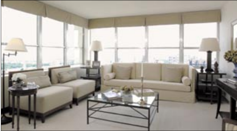
Two-bedroom condos, base priced from $254,500 to $293,000 feature a large living room with an adjoining dining room and plenty of windows.

priced from $175,900 to $293,000. (The studios are sold out). Five decorated models are open for viewing. Many of the units are available for immediate occupancy. All of the renovated units include new paint, carpeting, appliances, countertops, and maple cabinetry. One-bedroom units feature a kitchen with dining area, large living room, bedroom, bathroom with linen closet and foyer, which in some plans includes a walk-in closet. Two-bedroom condos feature a large living room with adjoining dining room, master bedroom suite with two closets and private bath, large secondary bedroom served by a full hall bath and foyer with coat closet.